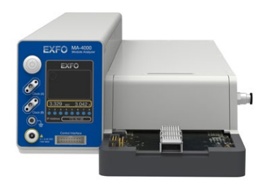
Minimized thermal chamber for industry's fastest thermal cycling