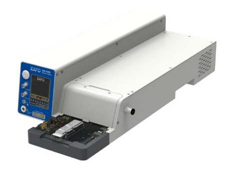
Easy-to-replace MCB in direct contact with BERT