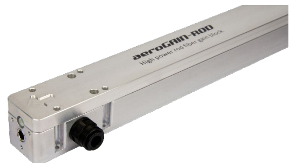
Figure 1: Picture of the aeroGAIN-ROD module.

The aeroGAIN-ROD fibers can be delivered mounted as aeroGAIN-ROD modules ensuring easy and secure handling as well as easy mounting and coupling. Figure 1 shows a picture of the aeroGAIN-ROD module. This ready to use solution ensures ROD fiber mounting without any stress introduced and protects the ROD fiber from the outer environment. The module has integrated water cooling with quick coupling giving efficient thermal management and long maintenance-free lifetime of thousands of hours. The module can be delivered with a ChromiAL TCP processed surface for industrial use by customer request. The aeroGAIN-ROD module has been severely tested with respect to climate change, vibration, and drop testing, and is very robust against transport and storage conditions. The module can tolerate large temperature changes from -30°C to 60°C and large vibrations, shock tested up to 1G at frequencies from 30Hz to 500Hz, without affecting the optical properties of the ROD fiber. Even when the module is packed for transportation it has been tested for drops of a few meters also without destroying the module or affecting the ROD fiber's optical properties. For specifications see the aeroGAIN-ROD module datasheet