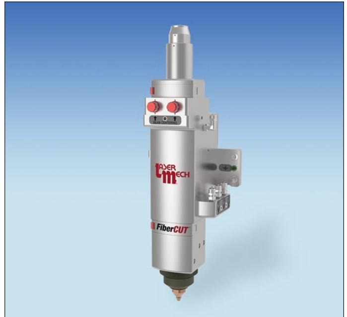
Laser Mechanisms' FiberCUT ® 2D processing head delivers cutting-edge performance for flatbed systems up to 8 kW.