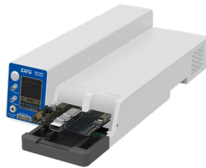
Easy-to-replace MCB in direct contact with BERT