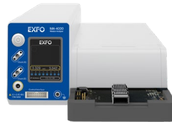
Minimized thermal chamber for industry's fastest thermal cycling